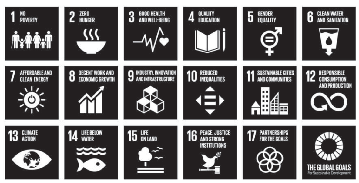
Figure 4 – Sustainable Development Goals. A global orientation towards sustainability (United Nations 2015).

However, it can take many years before just some of the conceptual and strategic considerations find their realization in regional management plans. One reason is that participative processes to define targets require time, and management plans usually cover a period of 10 years. Although minor adjustments to new policies can be implemented continuously, major amendments may be realized only in later management plans.